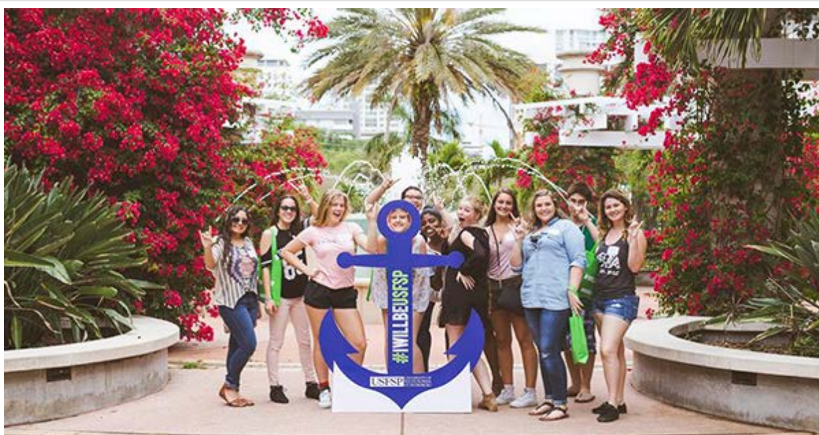
New USFSP students and their families attended the "Anchor" event on April 1.

Petersburg welcomed nearly 120 admitted students and 163 guests to the campus at the 4th annual "Anchor" event, which aims to prepare new students for orientation and their first day of classes. Anchor, which was developed in response to parent feedback, serves as a way for students and their families to get answers and experience life on campus before Move-In Weekend.