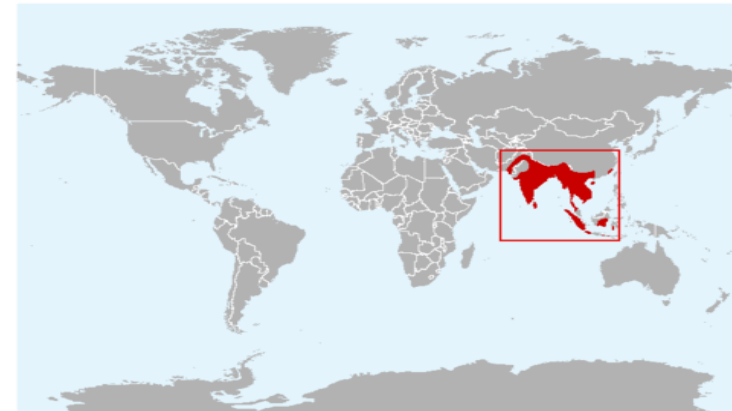
Figure 2. Map of the C. sphinx geographic range.

C. sphinx is common in Southern and South-Eastern Asia, particularly in Pakistan, Bangladesh, Bhutan, Cambodia, China, India, Indonesia, Laos, Malaysia, Myanmar, Philippines, Sri Lanka, Thailand, and Vietnam (Figure 2). C. sphinx bats are voracious frugivores with a preference for ripe guava, banana, dates, and lychee; they forage in mangrove forests, grasslands, tropical forests, and other areas where fruit is plentiful (Advani, 1982). C. sphinx bats typically roost in palm trees by constructing simple tents out of the palm fronds. They have also been known to intertwine vines and twigs to form nests; however, this is only done in areas where there are no available palm trees (Balasingh, Suthakar-Isaac, & Subbaraj, 1993).