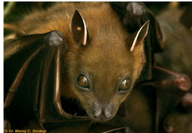
Figure 1. Defining white-edged ear and wing bones of the C. sphinx . http://www.manojcsindagi.in/gallery/main.php?g2_itemId=256

adult has a wingspan of approximately 48 cm and weighs between 63.5-75 g (Bates & Harrison, 1997). There is no consistent sexual dimorphism between males and females; however, there is research to suggest that males are, on average, larger in northern regions while females are, on average, larger in the south (Storz, Balasingh, Bhat, Nathan, Doss, Prakash, & Kunz, 2001). Researchers speculate that the larger male size in the northern regions is a sexually selected trait by the northern region females (Storz, et al. 2001).