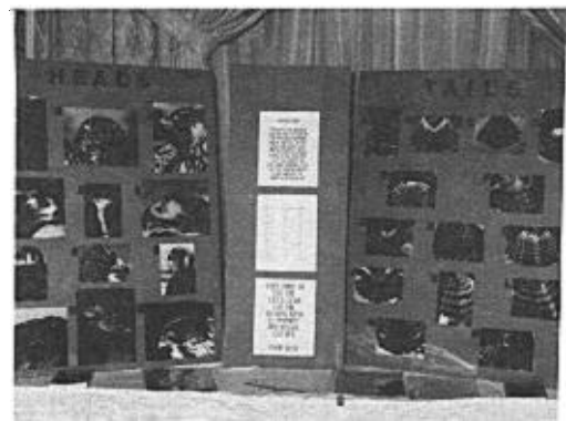
Raptor Quiz ( Heads and Tails )