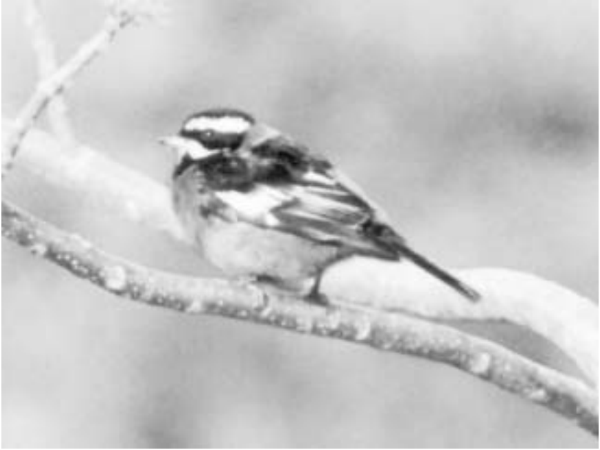
Figure 1. Male Western Spindalis ( Spindalis zena zena ) at Coquina Baywalk Park, Manatee County, on 26 April 1999. A photograph of this same individual was published in Pranty (1999, North American Birds , 53:273).

for central Florida. Even considering this report, all spindalises found in the state have occurred in Florida's "Tropical Zone" (Howell 1932:69-72), a biome with a largely West Indian flora growing mostly near the immediate coast south roughly of the 28th parallel.