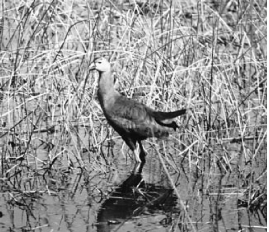
Figure 1. Adult Purple Swamphen at Pembroke Pines, Florida. Photographed by Bill Pranty, 9 October 1998.

Swampghens are large rallids that resemble Purple Gallinules ( Porphyryula martinica ) in shape and color (especially the races P. p. madagascariensis , poliocephalus and viridus ). However, swampghens have body lengths about 50% larger and wingspans nearly twice as long as those of gallinules (45-50 and 90-100 cm vs. 30-36 and 50-55 cm, respectively; Beaman and Madge 1998). Purple Swampghens have large red bills and frontal shields, red irides, orange legs and toes, usually with blackish areas at the heel and toe joints, white undertail coverts, and bodies that are pale blue, brilliant blue, purplish, or blackish. Australian birds are darkest, with blackish wings and backs, Phillipine birds are the palest and have rusty backs, and African birds have greenish backs. Juvenal plumage likewise varies, but is characterized by dull plumage and a dusky bill and frontal shield (del Hoyo et al. 1996, Beaman and Madge 1998).