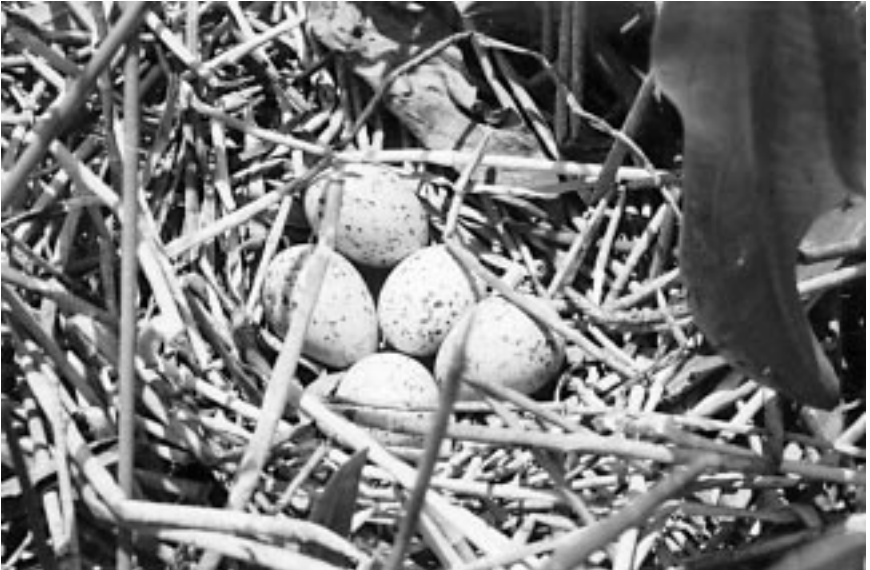
Figure 3. First documented Purple Swamphean nest in North America, at Pembroke Pines, Florida, 25 July 1999.

The current range of the Purple Swamphean in Pembroke Pines, Florida, is apparently bounded by Sheridan Street to the north, 600 m