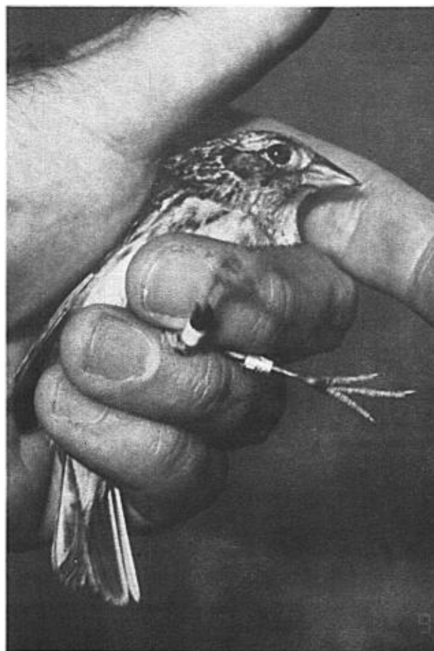
Figure 2. A Florida Grasshopper Sparrow marked with aluminum and plastic leg bands.