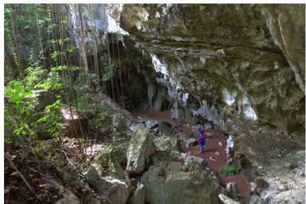
Figure 2. Main entrance of Grotte Marie-Jeanne.

With the exception of Grotte Marie-Jeanne, the cave management strategies for Haiti's other show caves is individual-entrepreneurial based consisting of controlled access and guided tours. There are no comprehensive management plans, maps, or resource inventories, to document important features of the caves or to promote future research. There is a lack of guidelines for conducting interpretive tours and no consideration is given to cave conservation or preservation. In Haiti, the absence of structured cave management reflects the lack of financial resources and expertise necessary