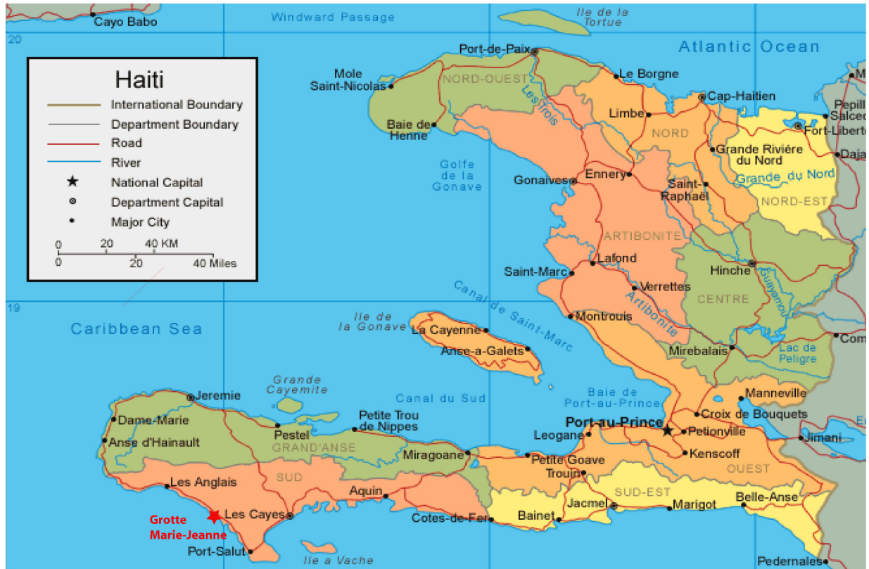
Figure 1. Map of Haiti with location of Grotte Marie-Jeanne site. Modified from www.travelinghaiti.com/

with exploration/documentation efforts, were initiatives to sustainably develop the cave for eco-tourism while preserving its unique ecology, geology and cultural setting. A further outcome of the Haitian-American team activities was the formation of the Haitian Speleological Survey whose goal it is to document and protect all caves and karst areas of Haiti.