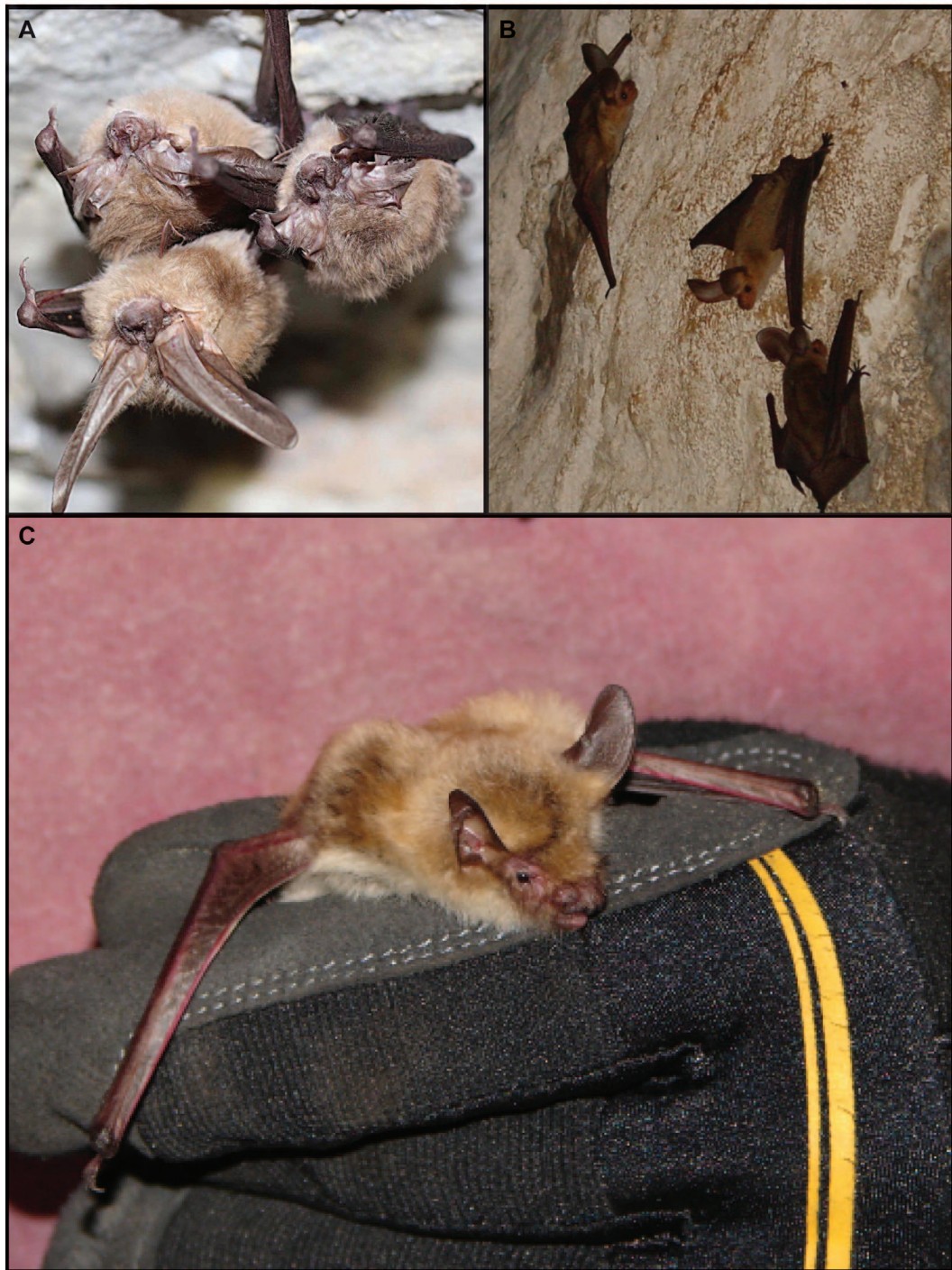
Fig. 2. Three cave-roosting bat species confirmed on Grand Canyon-Parashant National Monument, Arizona: A , 3 hibernating Corynorhinus townsendii from PARA 1401; B , 3 Antrozous pallidus from PARA 0802; C , Myotis thysanodes in hand during harp-trapping and mist-netting operations at the entrance of PARA 1801.