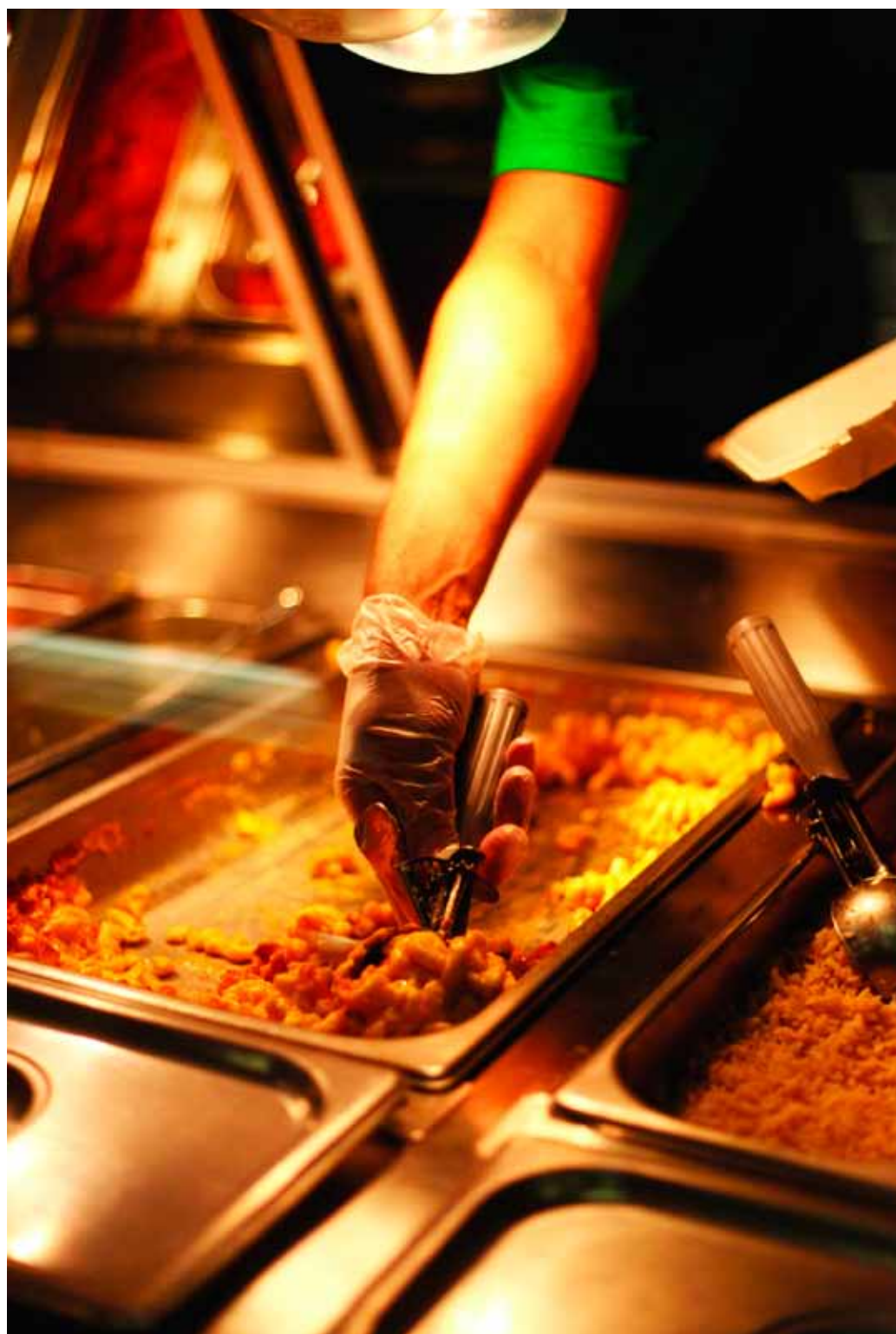
Thomas Boyd/The Crow's Nest

See also: Sodexo agrees to allow other caterers on campus, pg. 3