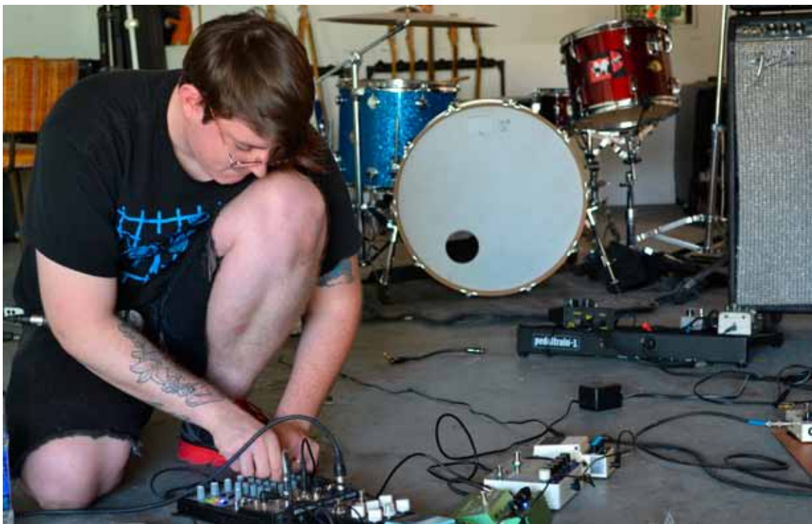
Ryan Ballogg/The Crow's Nest