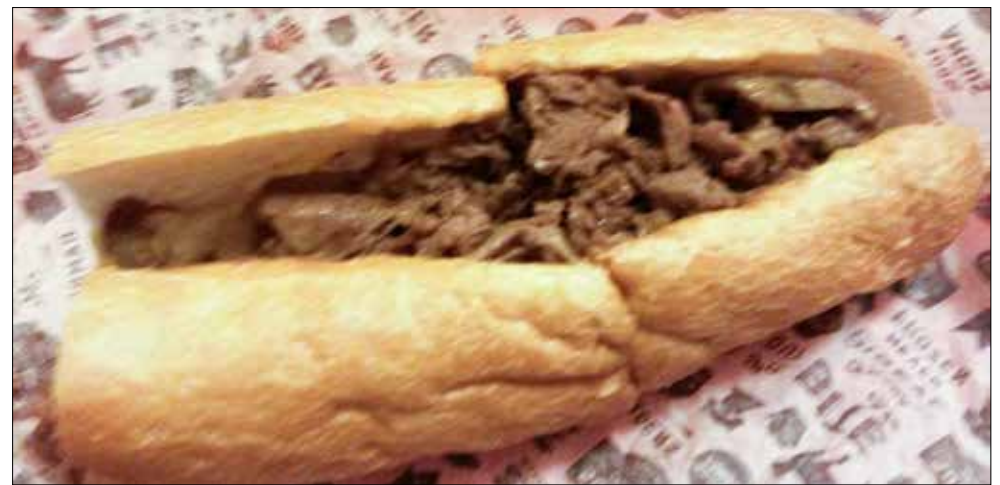
Andrew Caplan | The Crow's Nest

It was my favorite site in the city, despite being a tourist trap due to less fortunate locals bothering everyone trying to take a picture of, with, or next to the iconic "LOVE" statue. It's arguably one of the most beautiful scenery locations in a city where the