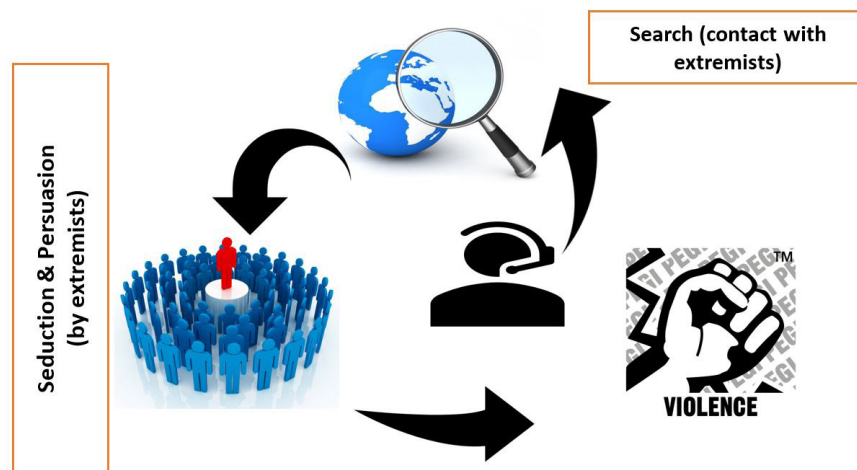
Figure 1. The process by which Individuals [Often] Come to Embrace Extremist Content Online.