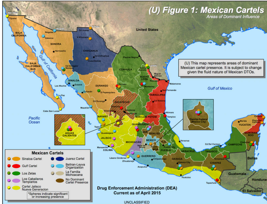
Figure 1. Mexican Cartel Areas of Dominant Influence According to DEA. This map shows areas of cartel dominant influence according to DEA as of 2015.