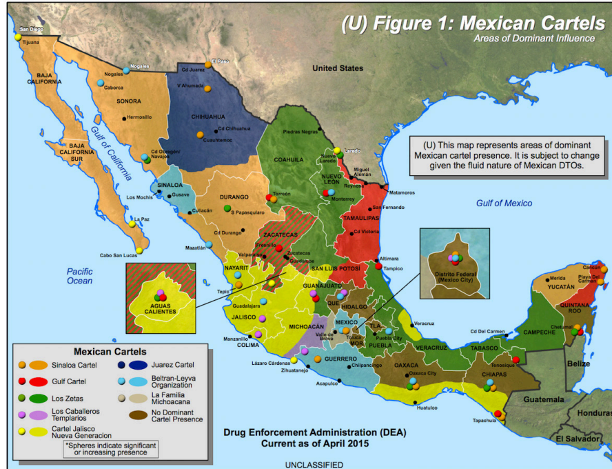
Figure 1. Mexican Cartel Areas of Dominant Influence According to DEA. This map shows areas of cartel dominant influence according to DEA as of 2015.

Source: United States Drug Enforcement Administration (2015) and Beittel, June S. "Mexico: Organized Crime and Drug Trafficking Organizations." Congressional Research Services, April 25, 2017. https://fas.org/sgp/crs/row/R41576.pdf .