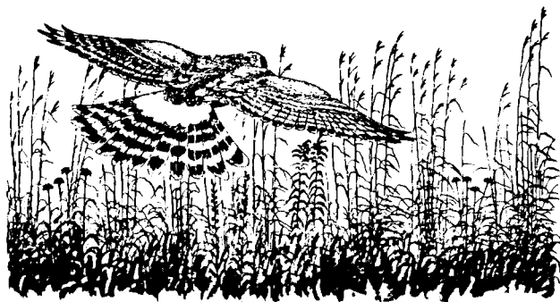
VIREOS with eye rings linked by loreal stripes to form "spectacles" always have wing bars. Other species have eyebrow stripes and no wing bars.

Understanding the sequence in which harriers molted their feathers used to strike me as peculiarly worthless information--that is, until it came time to mark birds for individual recognition.