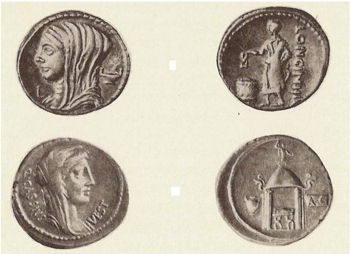
Fig. 2. Denarii with voting themes on reverse. Top, a voter deposits a ballot marked V ( uti rogas , or "yes") in a collection basket. Taylor 38; Syd. 935; RRC 413/1. Below, a ballot showing the options A-C ( absolvo, condemno ) used in the public courts. Syd. 917; RRC 428/1.