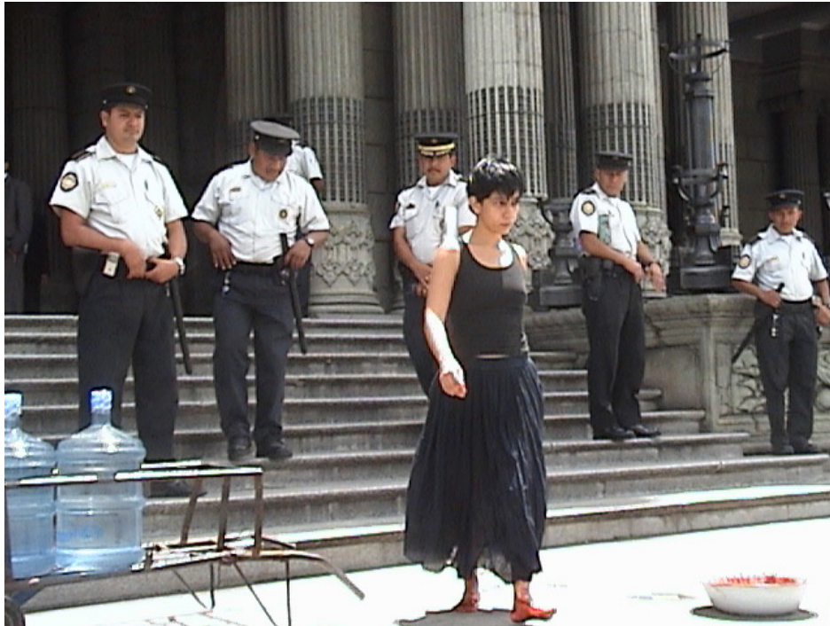
Figure 2. Regina José Galindo, Who can erase the traces? , 2003, © 2003 Regina José Galindo, http://www.reginajosegalindo.com/

when images of war circulate, they break away from their original contexts and thereby make recognizable what was previously unrecognized or misrecognized. Though Galindo's work is not commonly viewed as being about war, she often reframes scenes from Guatemala's civil war in ways that connect it to the ongoing war by other means.