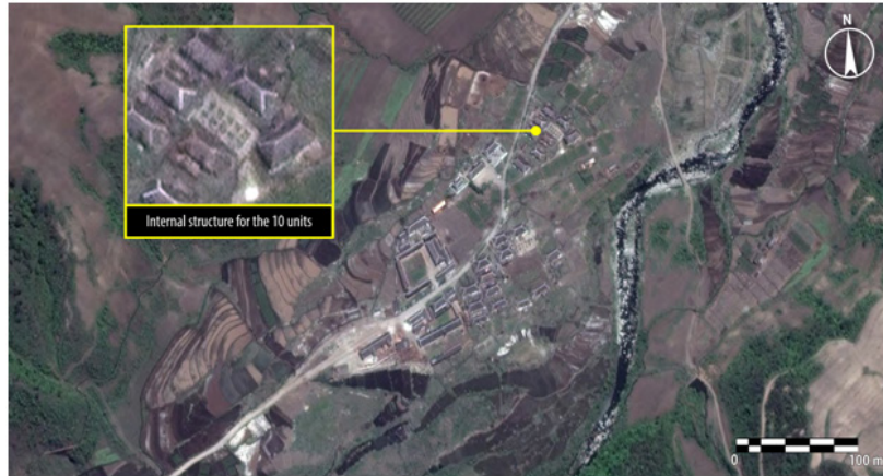
Figure 2. May 26, 2013.