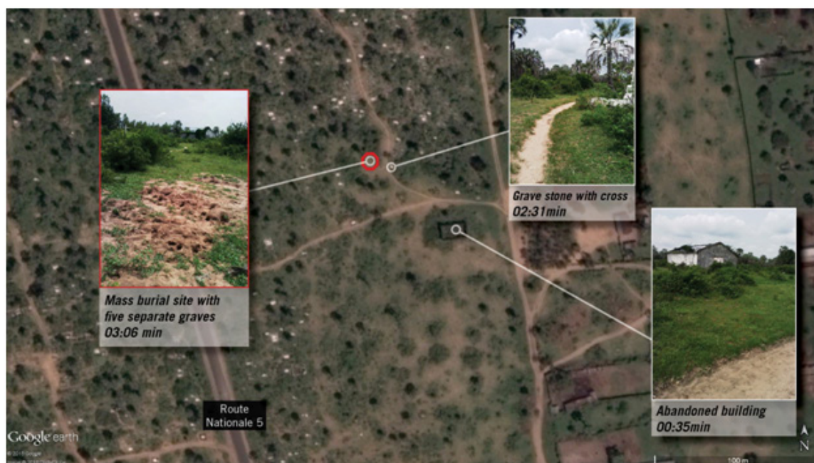
Figure 5. November 3, 2015. Graphic produced by author.

A shaky cell phone video of a desolated area was shared with Amnesty International. The short video did not reveal many reference points and ended with showing a small area of disturbed earth. A slow motion review of the video allowed analysts to extract crucial details: First, the video appeared to show five separate, small mounds. Second, the video included at least some geographic reference points, most notably an abandoned building, grave stones, and palm trees. Field and news reports suggested that one possible mass burial site was near Mpanda cemetery, to the north of the capital Bujumbura. A review of pre-event satellite imagery on Google Earth and other geographic databases eventually allowed pinpointing the exact location of the likely gravesite. Equipped with this new information extracted from the video and Google Earth, Amnesty International was able to commission analysis of new satellite imagery (Google Earth imagery normally does not provide the most current imagery. In this case, the available imagery was from prior to the event of interest).