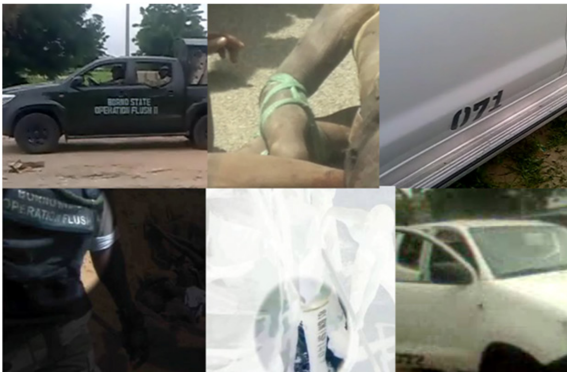
Figure 4. Some colors inverted using VLC Player, for enhancement purposes only. Graphic produced by author.

killed them, and threw their corpses in a river. Due to the clear geographic landmarks visible in the video (prison and bridge), it was possible to confirm the exact locations and reconstruct the event.