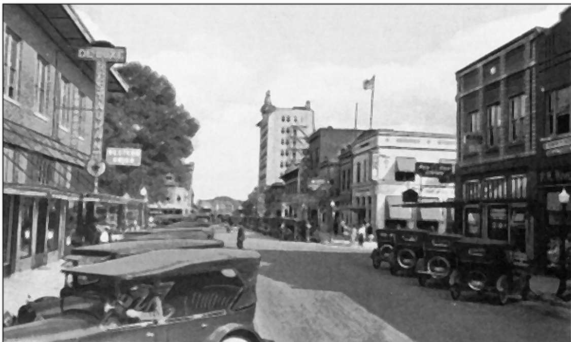
Lakeland's Main Street during the 1920s.