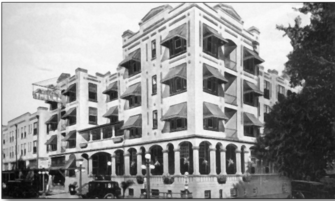
Lakeland's Hotel Thelma during the 1920s.