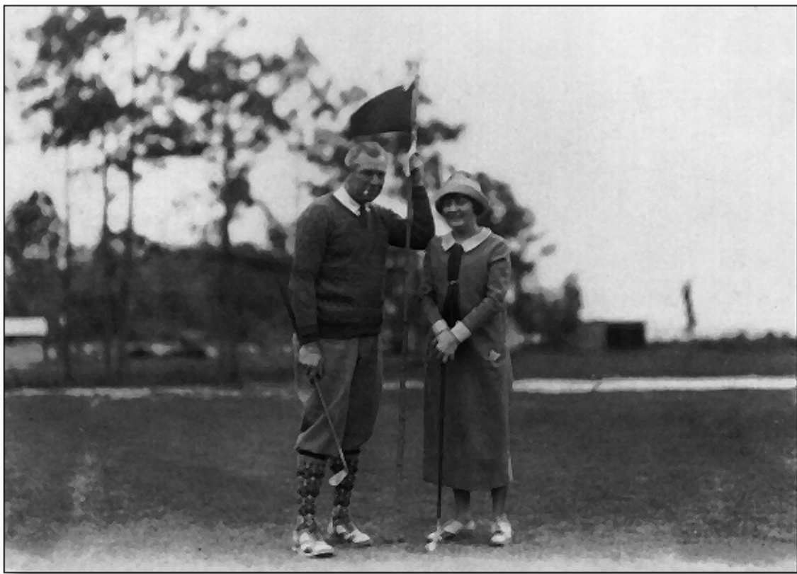
Tris Speaker and his wife playing golf in Lakeland during Spring training.

Photograph courtesy of Lakeland Public Library Special Collections.