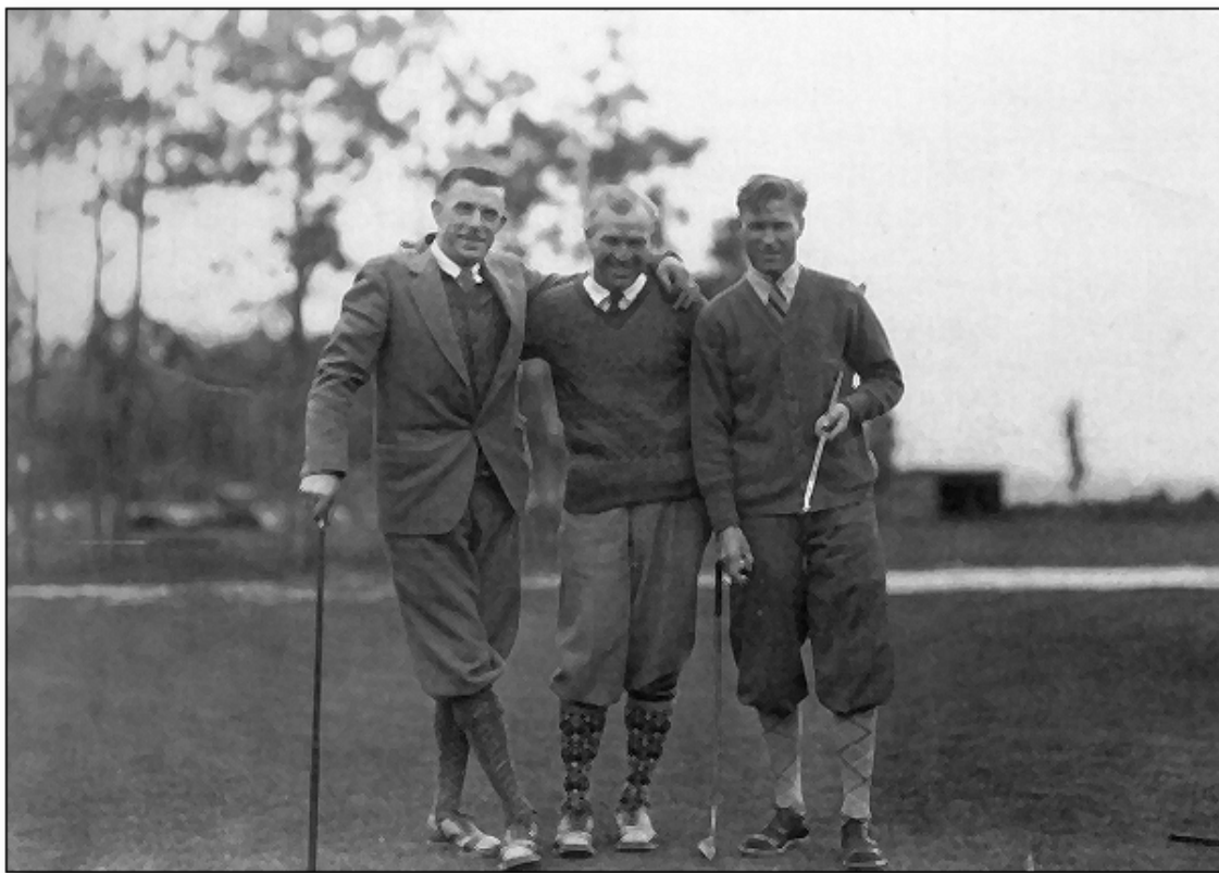
Grange Alvas, Tris Speaker and Eddie Loos.