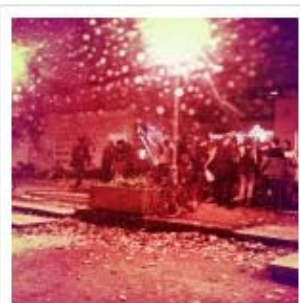
Party at the "officially" closed Theatre de la Place