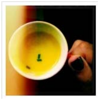
Pumpkin soup at a house party