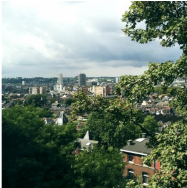
My bedroom view of Liège

The language comes quickly out of necessity, and while the first couple of weeks are shocking and slightly overwhelming, soon you find yourself understanding what the previous week sounded like the teacher on Charlie Brown, except 100 times faster.