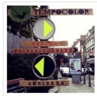
Cultural expo in Liège