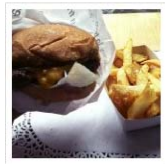
"La Frite", a delicious burger joint