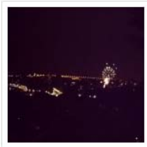
Fireworks over Liège