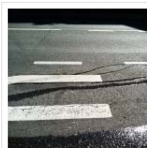
Result of a long bus wait