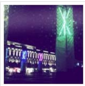
Place Saint-Lambert at night