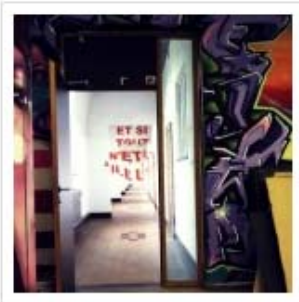
Third floor of Graphic Design building at Saint-Luc