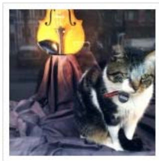
Always look around