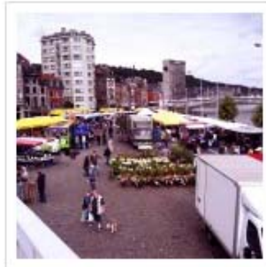
Sunday morning market along the river