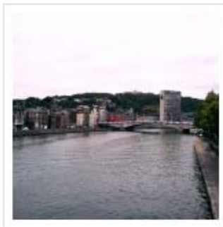
Bridge leading to Saint-Paul Cathedral