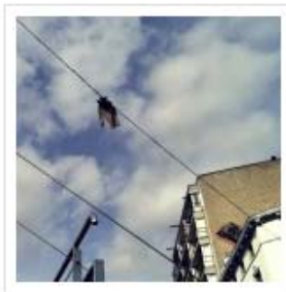
Always look up