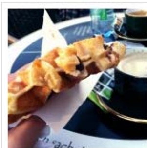
Chocolate "gauffre" at Pollux, best waffle place in town