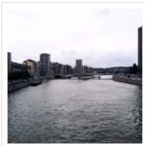
Bridge leading to City Hall