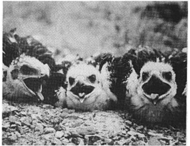
Three nestlings from southern nest.