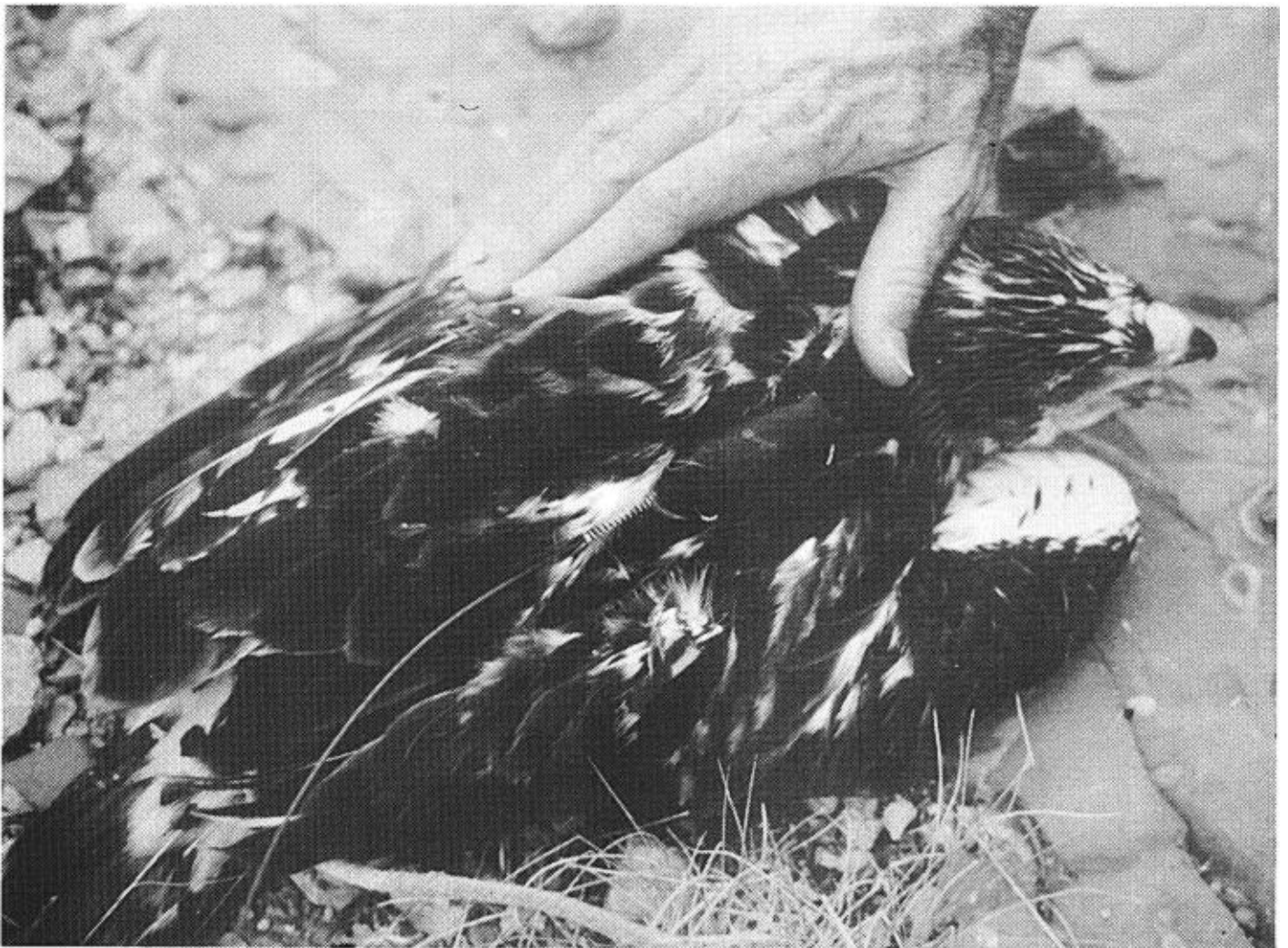
Nestling with radio package in place.