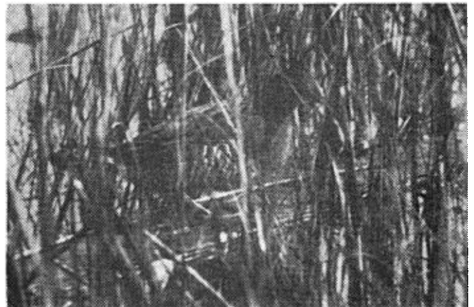
Figure 5. A Clapper Rail camouflaged in remnant vegetation during a high tide.