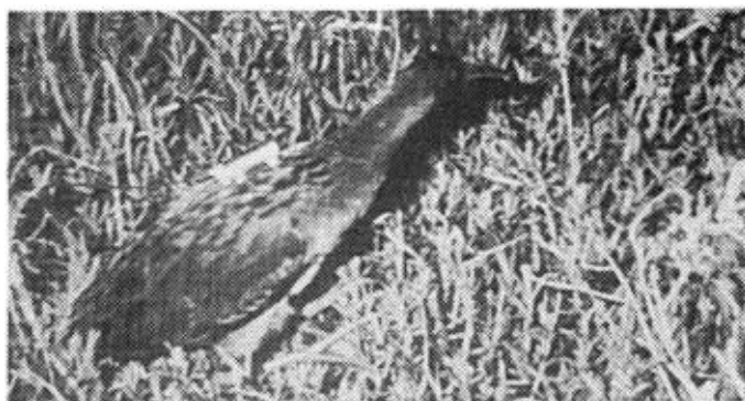
Figure 1. A radio-harnessed Clapper Rail, just after release.

The traps were set in tidal creeks and on small trails, mostly in dense cordgrass (Figure 2). The rails forage along small creeks and also use them as thoroughfares through dense vegetation. In August 1981, for example, 6 different first-year birds were taken from one 20-m stretch of a single creek, 4 of them from a single spot. Where creeks were lacking or poorly developed, trails through dense cordgrass were found in areas where unbanded rails had been observed and such trails were later trapped successfully. It appeared that an active bird would go through a trap readily, if the easiest path of travel was through rather than around the trap (Figure 3). This points out the utility of laying drift