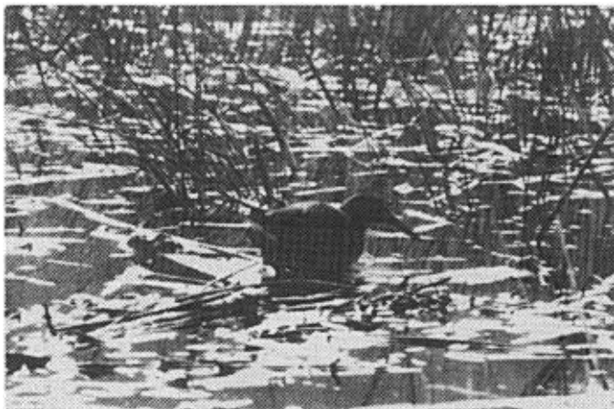
Figure 4. A Clapper Rail moving to cover during a high tide.

Netting from an air-boat during high tides is a good technique at marshes where large numbers of rails can be encountered on a single visit, as at San Francisco Bay. We have not yet tried an air-boat in Upper Newport Bay, since an abundance of non-inundated vegetation remains there to hide rails during even the highest tides. We have, however, tried night-lighting from an inflatable boat during summer high tides. On 9 evenings we encountered only 18 rails in places suitable for netting attempts. Six of the 18 birds were on nests and were left undisturbed, 11 eluded our attempts to net them, and one was caught (a recapture). Without the