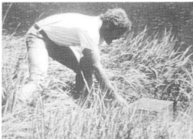
Figure 2. Setting a trap in cordgrass.