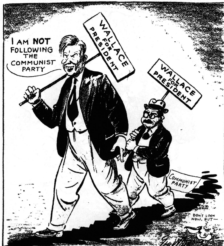
Wallace's supposed link to the Communist Party. ( Tampa Sunday Tribune , February 15, 1948.)

FBI, hugely expanded under the direction of J. Edgar Hoover.