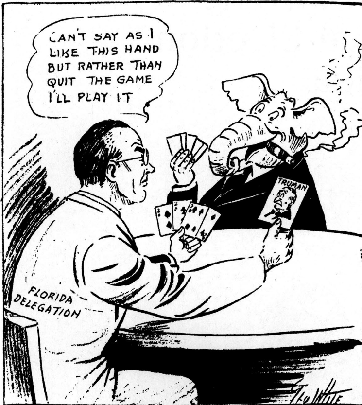
Gov. Caldwell's reluctant endorsement of Truman for reelection. ( Tampa Morning Tribune , October 30, 1948.)

The population of Ybor City was somewhat of a regional anomaly in its progressive character. While the early years of the community were notable for frequent labor strikes, such activity had largely subsided by the Forties. The radicalizing tradition of el lector had been eliminated in the early years of the Great Depression, union activity decreased with the decline of a once-flourishing cigar industry, and many Latins had begun assimilation into the mainstream Anglo-Tampan population. Historians have concluded that by 1948 the last "dying breath of radicalism" in Ybor City had been expelled as residents adjusted to the increasing conservatism and exclusivity of American life. The presidential election of 1948, however, suggests a continuity of radicalism which, while altered, was never entirely squelched. 3