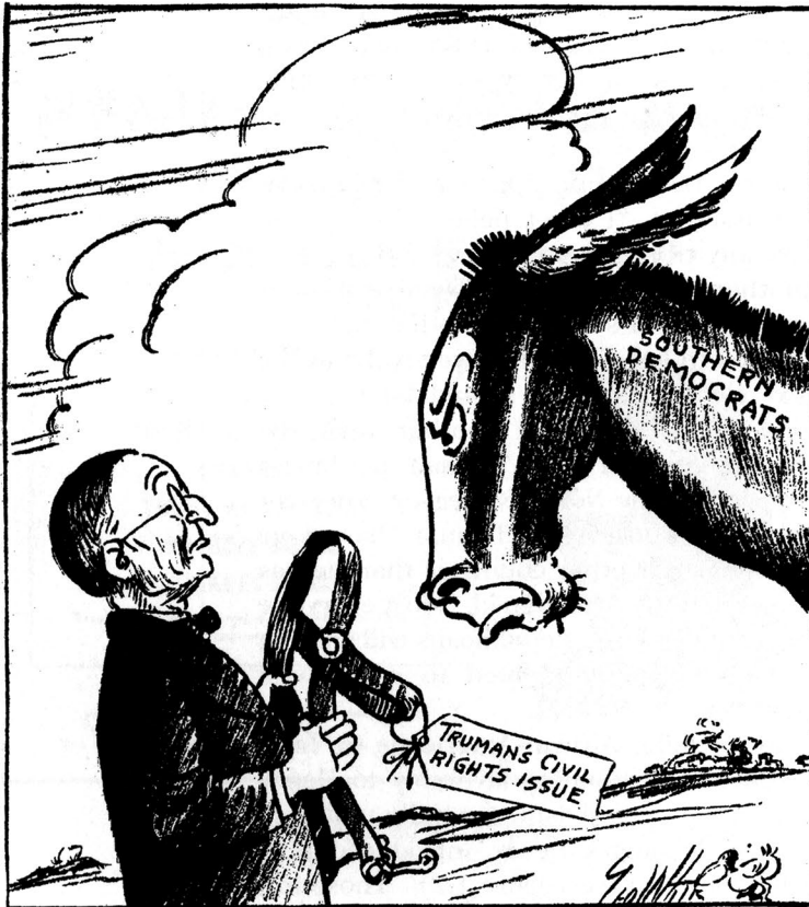
Truman's attempt to "bridle" the civil rights issue. ( Tampa Morning Tribune , February 4, 1948.)

members parading through the small towns of central Florida. On one occasion, a cross was burned near the planned site for the registration of African-American voters. In Pinellas County, a "fiery cross" was found burning in the front yard of a Gulf Beach home – the first reported in that county in nearly seven years. As the elections drew closer, incidents were reported in local newspapers with increasing frequency. "Tonight was the first time in recent years," reported the Tampa Tribune on the eve of the election, "that the Klan has attempted to make a show of strength in Florida." The atmosphere was increasingly charged with racial friction and hostilities, evidence of the significance that the upcoming election held for so many varying interests. By late October, many local residents had become fed-up with such behavior. The demonstrations, one columnist wrote, "Can tend only to arouse and inflame racial feeling ... The evident purpose is to deter Negroes from voting in the election – a right granted them by the Constitution of the United States." 22