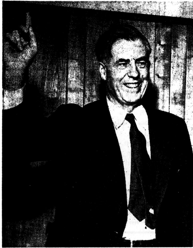
"Not a third party, or even a second party, but the real first party," Wallace emphasized.

In February 1948, the Tampa Tribune reported that Truman had petitioned Congress to pass federal laws against discrimination "in voting or employment" on the grounds of race or ethnicity. Rejecting Southern claims of state-level autonomy, Truman asserted that, "The Federal Government has a clear duty to see that constitutional guarantees of individual liberties