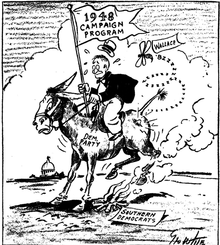
Truman's attempt to maintain control of the fractious Democratic Party. ( Tampa Morning Tribune , February 21, 1948.)

nomic exploitation within a nation that professed commitment to the values of freedom and equality. Such was the atmosphere in 1948 when four presidential candidates ran for the nation's highest office, expressing radically different visions of the world and the position of the U.S. within it. 7 These four candidates – Truman, Dewey, Thurmond, and Wallace – represented four streams of political thought and political action.