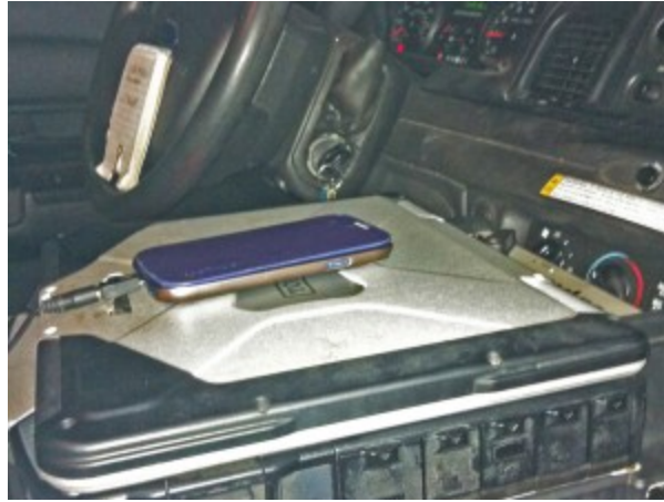
The inside of the police cruiser

Posted February 18, 2013 at 4:55 pm by Chelsea Tatham '14