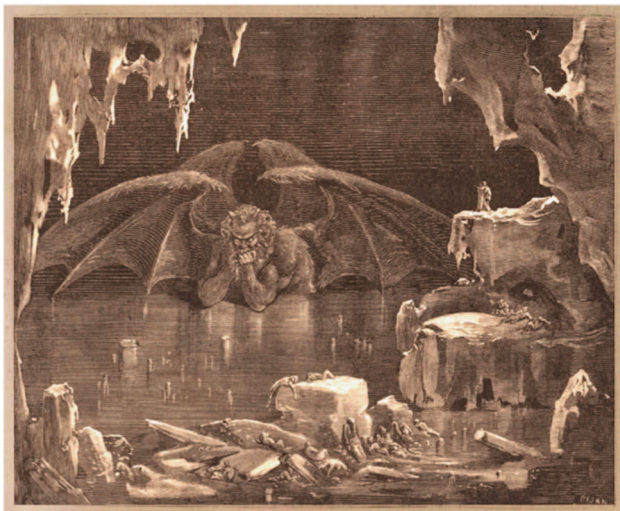
Figure 2. Satan. Modified from Dante Alighieri's Inferno from the Original by Dante Alighieri and illustrated with the designs of Gustave Doré – 1861.

MERS-CoV is phylogenetically related to SARS-CoV and share with SARS-CoV the origin in bats. 23,26,27 Several CoVs have been identified in insectivorous and frugivorous bat species in various countries, indicating that bats may represent an important reservoir of these viruses. 23 MERS-CoV was first identified in Saudi Arabia in 2012 and then spread to other countries causing hundreds of deaths. 26,28 Clinical features of MERS-CoV are similar to SARS-CoV, although this virus has also been associated with several extrapulmonary manifestations, such as severe renal complications. Recent studies have indicated that dromedary camels may be the intermediate hosts and potential source of the virus for humans. 26,29 In addition, the first experimental infection of bats with MERS-CoV has been described. The virus maintains the ability to replicate in the host without clinical signs of disease, supporting the general hypothesis that bats are the ancestral reservoir for MERS-CoV. 30 Human-to-human transmission has also been reported. Based on epidemiological data, both animal-to-human and human-to-human transmission are considered to be important elements in MERS outbreak. 26