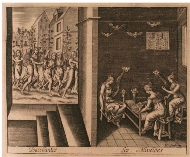
Figure 1. Bacchantes – Les Minéides. Illustration de Les Métamorphoses d'Ovide. Modified from Jean Mathieu, graveur; Ovide, auteur du texte. Éditeur: veuve Langelier (Paris) – 1619.

(Translated by AS Kline: www.poetryintranslation.com/ ).