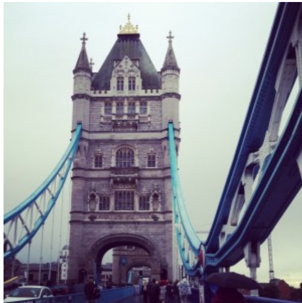
London Bridge