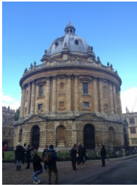
Radcliffe Bodleian Library University of Oxford