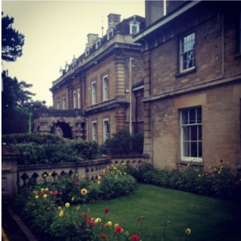
Oxford School of Law