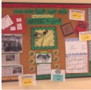
Arabic Bulletin Board