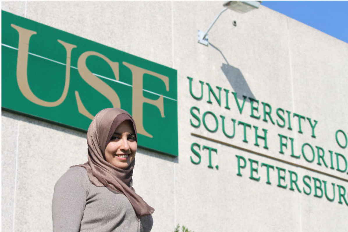
USFSP Arabic Instructor