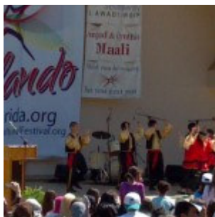
A field trip to the Arabic Festival in Orlando