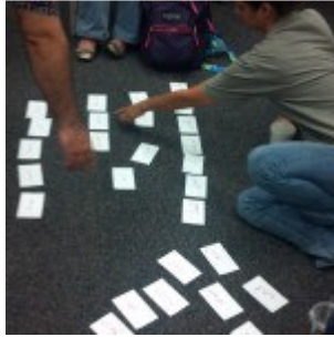
Class Activity. Reordering scrambled sentences