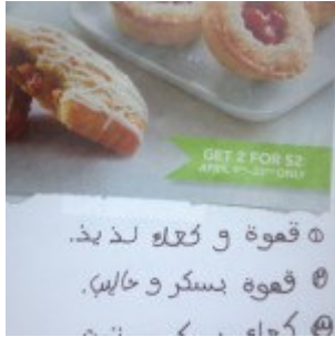
Arabic sentences written by an Arabic I student.