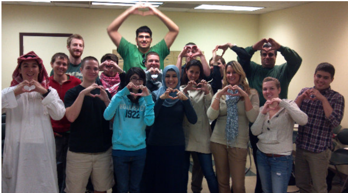
Final class group picture of the first Arabic students in USFSP, Fall 2011.