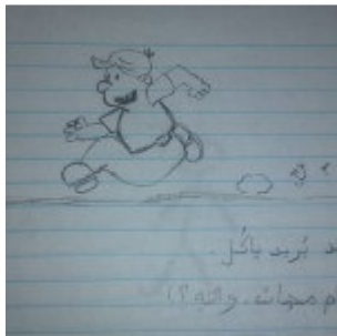
A work by an Arabic I student.