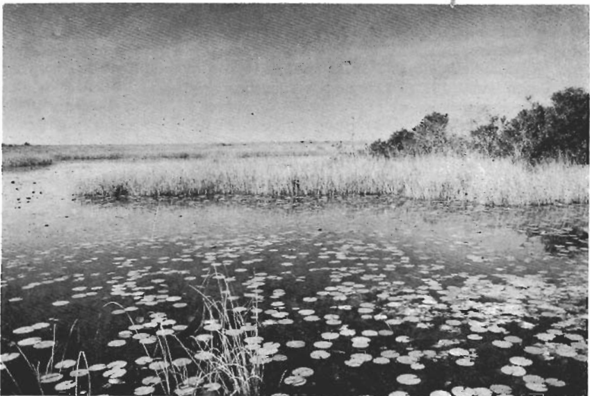
Fig. 1. Snail Kite habitat in southeastern Conservation Area 3A, Broward County, Florida. An aquatic slough white water lily ( Nymphaea odorata ) is in the foreground and sawgrass ( Cladium jamaicensis ) stands and a tree island are in the background. Kites hunt for apple snails over the sloughs.

The Everglades (Fig. 1) occupies a shallow basin extending 161 km from Lake Okeechobee to Florida Bay and is 48-80 km wide. Land elevations range from 5.8 m msl near Lake Okeechobee to 0.3 m msl in the south. The original