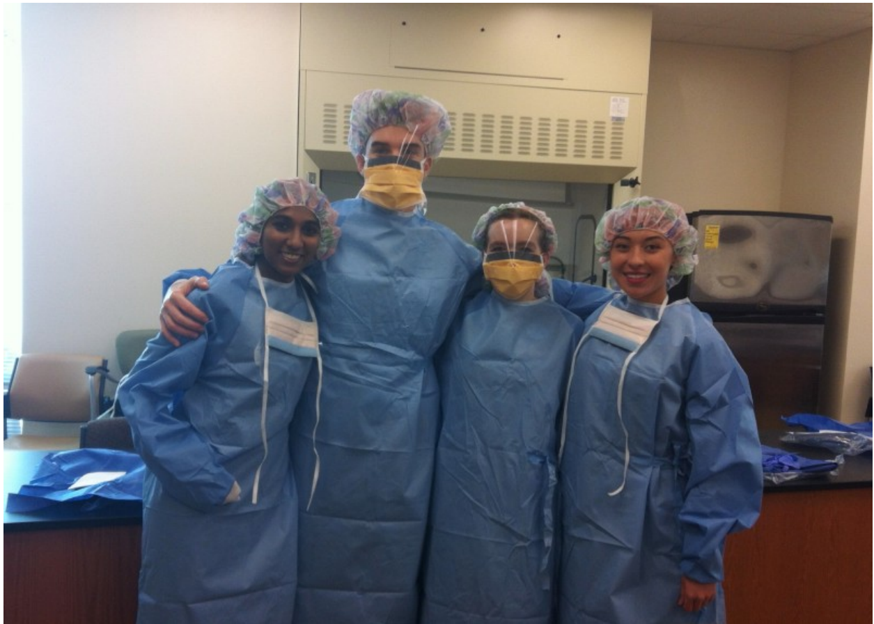
Four USF St. Petersburg students in the sinus lab

Posted November 2, 2012 at 2:23 pm by Tom Scherberger