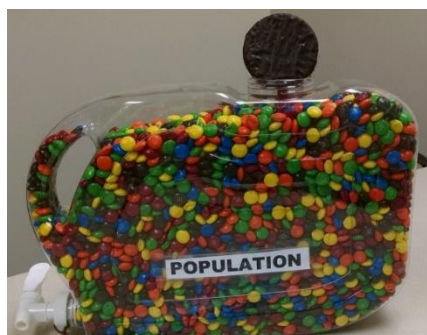
Figure 3a. Parameter (colloquial use of the term, candy population)

Two activities were created to target the word pair parameter/statistic : All vs. Small and Candy Jar. The All vs. Small activity was modeled closely on the Zebra vs. Hat Activity although, instead of contrasting the colloquial and technical meanings of the words, All vs. Small exploits the contrast between the population and the sample. The population is the All, and information about the All is the parameter . The sample is the Small, and the information about the Small is the statistic . In the Candy Jar Activity, the definition of parameter in the everyday sense is introduced by the use of a foil-wrapped candy that is too large to be put into the container (Fig. 3a). Because of its size, the foil-wrapped candy does not meet a required characteristic or condition for inclusion in the population. In other words, it does not fulfill the required parameters for inclusion in the population. Figure 3b shows two jars with colored-coated chocolate candies; the larger jar represents the population and the smaller one represents the sample with emphasis on the statistical meaning of parameter as a summary measure from the population. Video files of instructors using the All vs. Small and Candy Jar activities can be found at https://hilt-statistics.wikispaces.com/ .