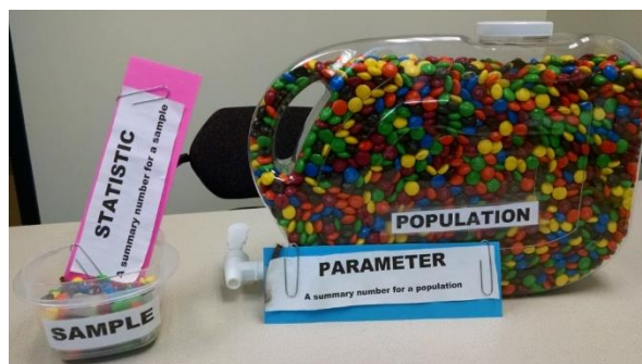
Figure 3b. Parameter (statistical use of the term, candy population)