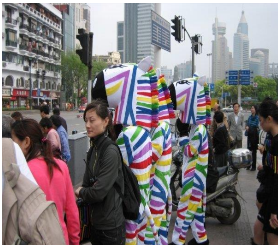
Figure 2a. Zebra picture to represent the colloquial meaning of random

random by contrasting the two meanings, colloquial and technical, using images to which the instructor can easily refer over the course of the semester. For example, an instructor might say, “remember, when I say random , I mean the hat not the zebras.”