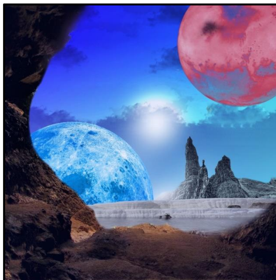
Figure 3. A parallel or fantasy universe as an analogy for the null hypothesis in hypothesis testing.

One of the most challenging concepts in introductory statistics is the P -value. Many instructors have been disappointed to find that at the conclusion of the course, after students have successfully calculated dozens of hypothesis tests, they still cannot explain what a P -value is. We have constructed an analogy around the idea of visiting a science fiction world. Figure 3 shows one visualization, but in class we might select screenshots from a popular science fiction movie such as Avatar .