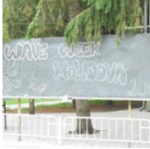
Wave Week Moldova