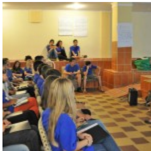
Wave Week Moldova