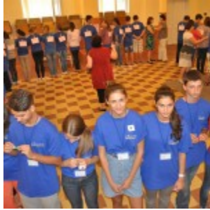
Wave Week Moldova