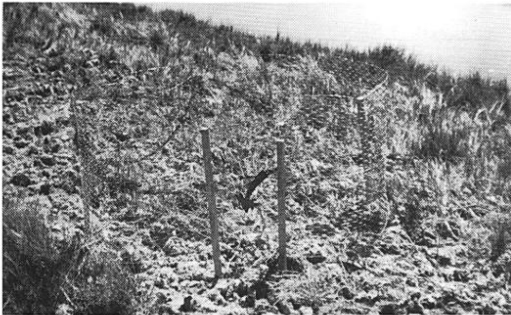
Figure 1. Cardioid nest trap in place at a Black-necked Stilt nest. (Arrow points to nest.)