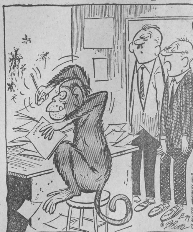
"How's he coming along on those course schedules? We've got to get them to the students pretty soon."