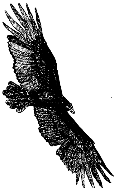
Logo sketch by Barb Petorak