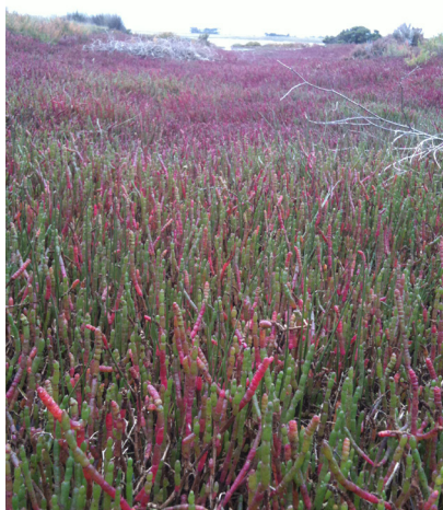
FIGURE 6. Beaded glasswort ( Sarcocornia quinqueflora ).