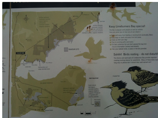
FIGURE 2. Sign explaining that Limeburners Bay belongs to wetlands protected under the Ramsar Convention.

Following this cataclysm, Indigenous ecological practices continued to break down. Crucial knowledge of environmental maintenance was lost to specific locales as people were effectively removed. Compounding this, Europeans intentionally introduced new species (sheep, cows, rabbits, wheat) and accidentally brought weeds, rats etc. Currently, an estimated 30 per cent of Victoria's native animals, and close to half of its plant species, are "already extinct or threatened with extinction", in what the Australian Conservation Fund (2009) calls an extinction crisis.