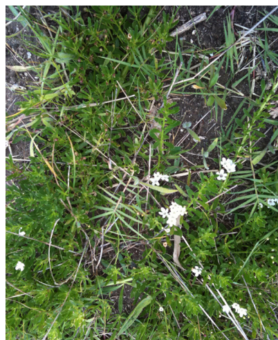
FIGURE 9. Creeping boobialla ( Myoporum parvifolium ).