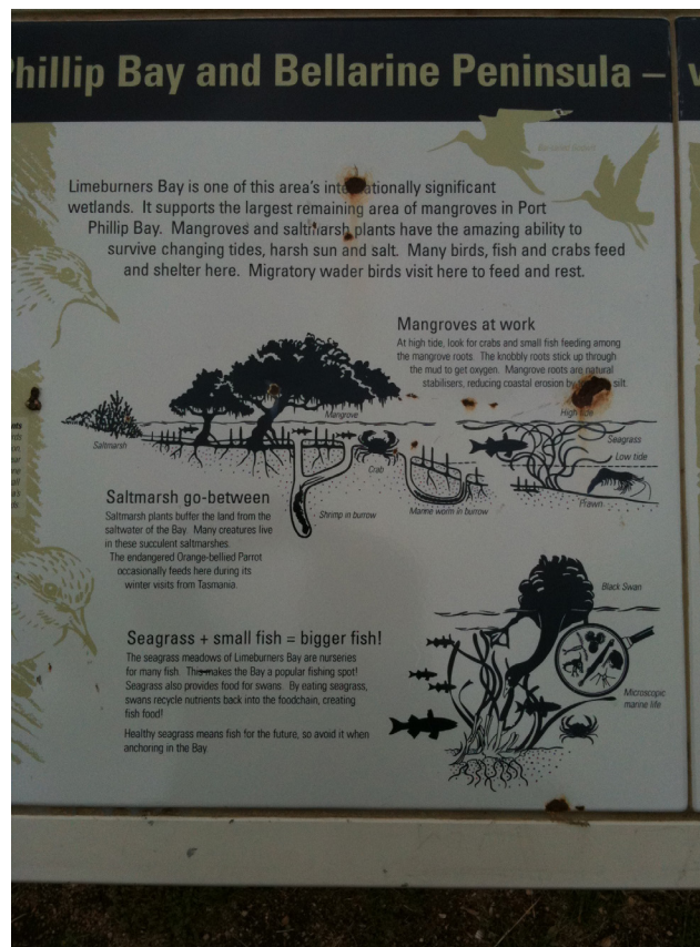
FIGURE 3. Sign explaining ecology of saltmarsh and mangroves.

animal and plant life. Areas of Limeburner's Bay are covered under the Ramsar Convention, which protects wetlands in various worldwide locations. The area comprises lands of the Indigenous Australian tribe, Watha Wurrung.