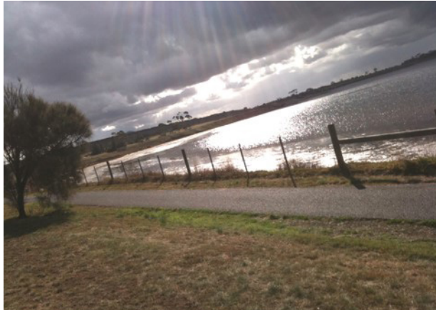
FIGURE 1. Sunshine breaking at Limeburners Link fieldsite.

Pertaining to this article, environmentalism embraced an existing commitment to protected areas (national parks, wildlife sanctuaries etc.) which dated back to late 1800s (Spence 1996). Environmentalism was also associated with a seeming innovation known as conservation projects. Conservation projects seek to restore or manage damaged habitats, such as abandoned mines and polluted waterways. As with Limeburner's Link, conservation projects have also taken place in protected areas.