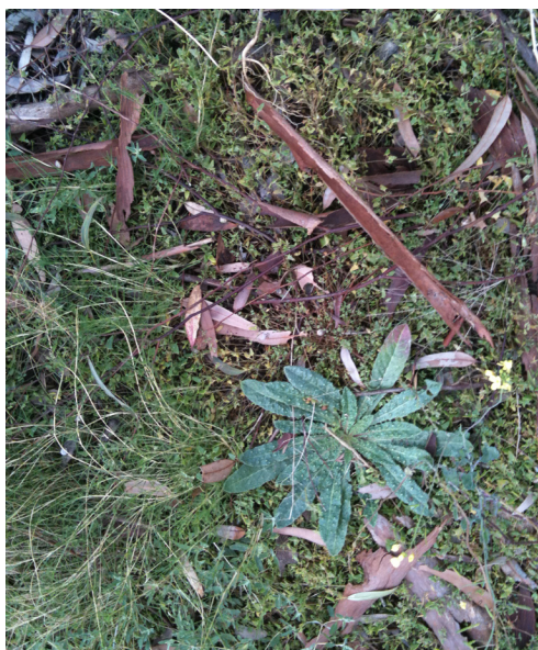
FIGURE 12. Ox tongue ( Helminthotheca echioides ), originates from Europe and Western Asia.