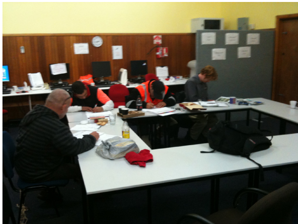
FIGURE 17. Trainees doing coursework before heading into the field.

precisely because they so closely resemble indigenous species. The guiding principle was “if in doubt, don’t pull it out”.