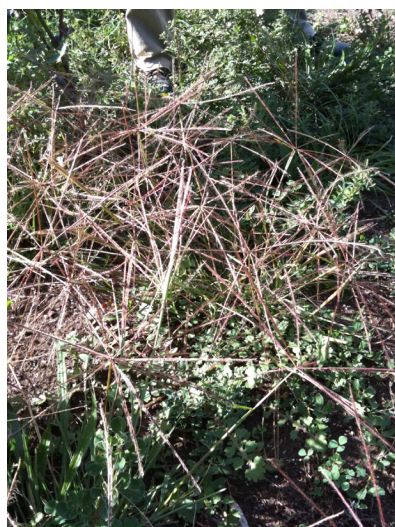
FIGURE 8. Windmill grass ( Chloris truncata ).