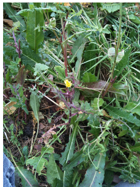
FIGURE 13. Milk thistle ( Sonchus oleraceus ), native to Western Asia, Europe and Northern Africa.