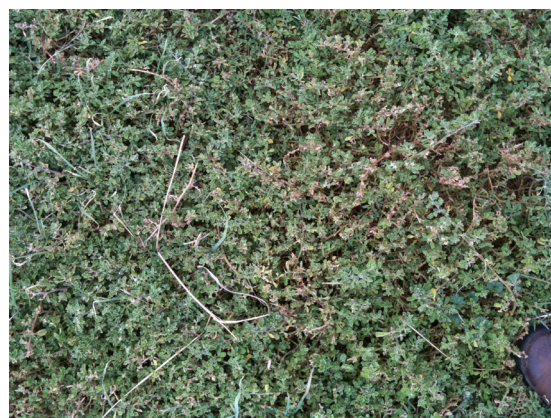
FIGURE 11. Galenia ( Galenia pubescens ), native to Southern Africa, is a ground cover apparently introduced to Australia to cover disturbed ground around mines and roadsides.