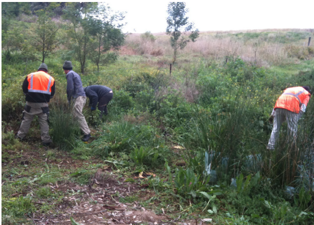
FIGURE 4. Limburners Link trainees.

Indigenous Australians in the greater Geelong area. On any given day, the number of Indigenous trainees attending varied. Additionally, there were several non-Indigenous volunteers, whom I joined on five occasions over 2010 and 2011. The numbers of volunteers also varied.