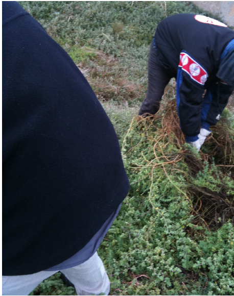
FIGURE 16. Hand weeding Galenia to protect the remnant pocket of Beaded Glasswort.