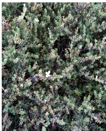
FIGURE 7. Frankenia ( Frankenia pauciflora ).