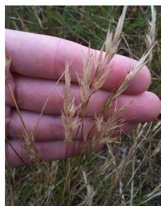
FIGURE 10. Wallaby grass ( Rytidosperma caespitosum ).