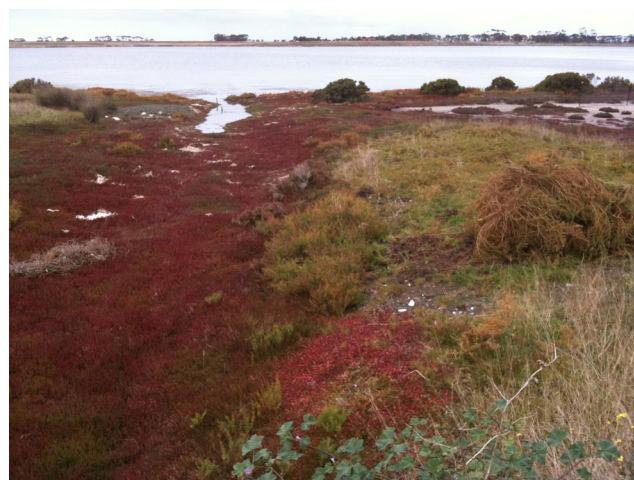
FIGURE 15. Edge effect.

to protect a pocket of remnant population. This was a relatively isolated and containable area being surrounded by a road, a shed, and a fence.