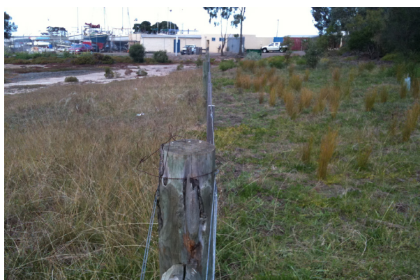
FIGURE 14. Heavily weeded area of remnant population observable to right of fence. To the left, Chilean needle grass ( Nassella neesiana ) (an invasive species) prevails.