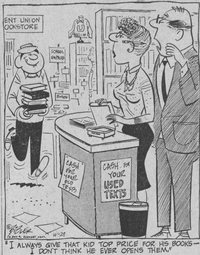
"I ALWAYS GIVE THAT KID TOP PRICE FOR HIS BOOKS—I DON'T THINK HE EVER OPENS THEM!"