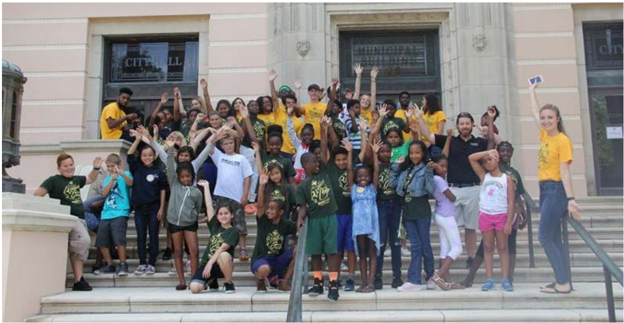
Elementary students in the "PREP for Middle School Success" program along with USFSP education majors take a field trip to St. Petersburg City Hall.

Learning outside the classroom is one of the pillars of the academic experience at USF St. Petersburg. Some of these experiences impact more than just the college student; they lift up others within the community. A program in the College of Education is providing hands-on teacher training for USFSP students while giving children of underserved schools vital leadership training and support as they transition to middle school.