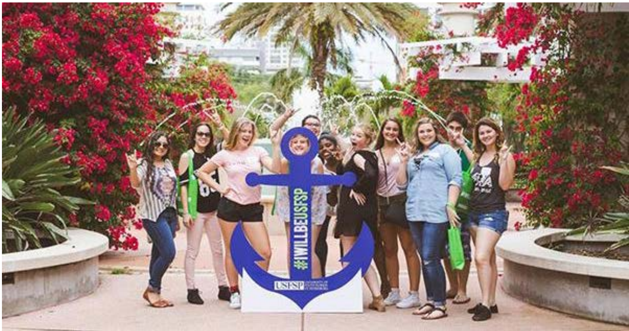
New USFSP students and their families attended "Anchor" on April 1.

Partners from across the USFSP community joined together to welcome nearly 120 admitted students and 163 guests to the campus at the fourth annual "Anchor" event. Anchor, which aims to prepare new students for orientation and their first day of classes, was developed in response to parent feedback. It serves as a way for students and their families to get answers and experience campus life before Move-In Weekend.