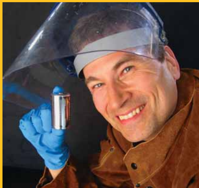
NOVA "Search for the Super Battery" Join renowned gadget geek and host David Pogue as he sets out on a quest to discover how batteries work and uncover what the future of batteries means for our gadgets, our lives and even our planet. Airs Sunday, February 19, at 8 p.m.