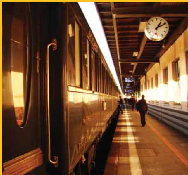
The World's Most Famous Train The Venice Simplon Orient Express is considered the most luxurious and romantic train in the world. In this insightful documentary, viewers hear the stories of train enthusiasts on a 36-hour ride into the golden age of travel. Airs Sunday, February 26, 9 p.m.

Learn more about Florida's history, Sunday mornings at 9:30 on Florida Frontiers .