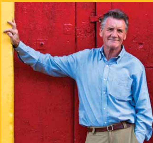
Brazil with Michael Palin Brazil is a mix of races, religions, wild-ness, wealth, poverty and unexplored wilderness. Michael Palin travels from the lost world of Amazonia to the buzzing metropolis of Rio de Janeiro, to meet the people and visit the places that shape this nation. Aired Wednesdays, 9 p.m., beginning July 6.