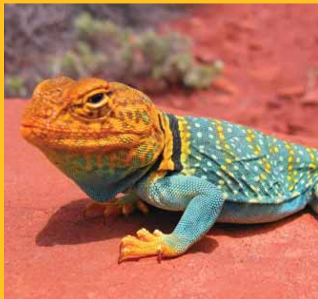
Dragons Alive Evolved from the era of the dinosaurs, today's reptiles are the ultimate success story. They are as deadly as dinosaurs, as beautiful as birds, and as caring as mammals. This series brings reptiles out of the shadow of dinosaurs and reveals their world. Aired Thursdays, 10 p.m., beginning July 7.