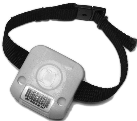
Figure 1. RTLS wristband with compact tag used in this study. It is both small and wireless, making it useful in this domain

When the mannequin was held upright in a standing position, seated in a wheelchair, or laying on the bed, the compact tag fitted on the mannequin's wrist was about 0.5 meters above the floor. Across all positions,