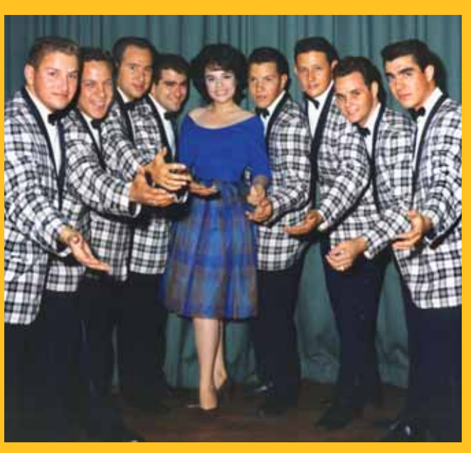
The Fabulous Rockers Forever! In 1957, nine teenagers got together in an Ybor City garage to play rock and roll that captivated a generation and created a love that's lasted more than 55 years. This documentary shines a light on one of Tampa Bay's most revered musical groups. Airs Monday, February 15, 8 p.m.

On Thursday, February 11, WUSF will air the Democratic Presidential Debate live from Milwaukee, Wisconsin, 9-11 p.m. Our regular programs for that evening (Life on the Reef at 9 p.m. and Earth's Natural Wonders at 10 p.m.) can be found on WUSF 16.4, Bright House 619, Comcast 207, and Verizon 471.