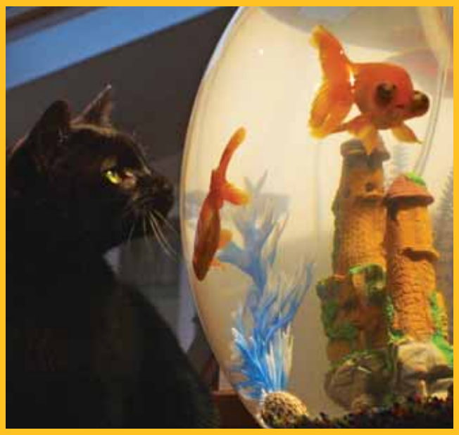
Nature "Pets Wild at Heart" In this two-part special, we investigate how our favorite pets get in touch with their wild side through play, and discover how they experience the world through their astonishing senses and hidden channels of communication. Airs Thursday, February 4 and 11, 8 p.m.