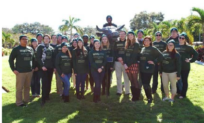
The 2016 Road to the White House class

On Jan. 31, students at USF St. Petersburg will head north as part of the Road to the White House class. During the quadrennial class, which has been offered every four years since 2004, they will visit New Hampshire and participate in the presidential campaigns for seven Democratic