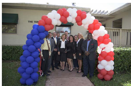
Pinellas County elected officials joined USFSP leaders for the ceremony.