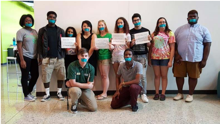
USFSP students cover their mouths with tape in representation of the sexual assault victims who often feel silenced about their victimization.

USF St. Petersburg and its Student Government organization are standing with others from around the USF System against sexual assault and violence. The effort falls in line with the " It's On Us " national week of action.