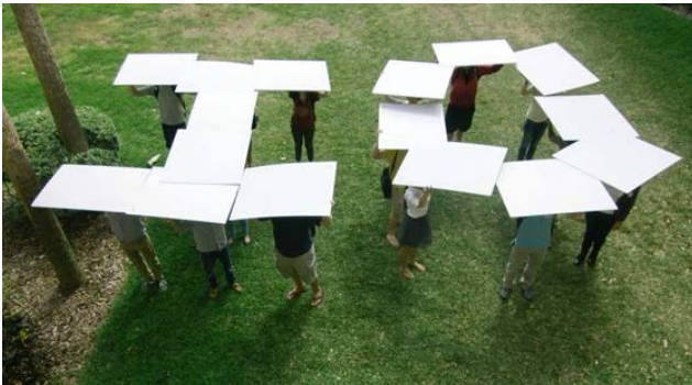
"Innovation Overnight" will be held on April 10 and 11.

USFSP's Kate Tiedemann College of Business, in partnership with the student chapter of Tampa Bay Technology Forum, will host "Innovation Overnight," a 20-hour design-a-thon during which college students from throughout the area solve real-world problems pitched by local business leaders. The event will be held at the University Student Center on Friday and Saturday, April 10 and 11. Sponsors of the event, which will provide the problems for young entrepreneurs to solve, include Jabil, Valpak and the Tampa Bay Rowdies.