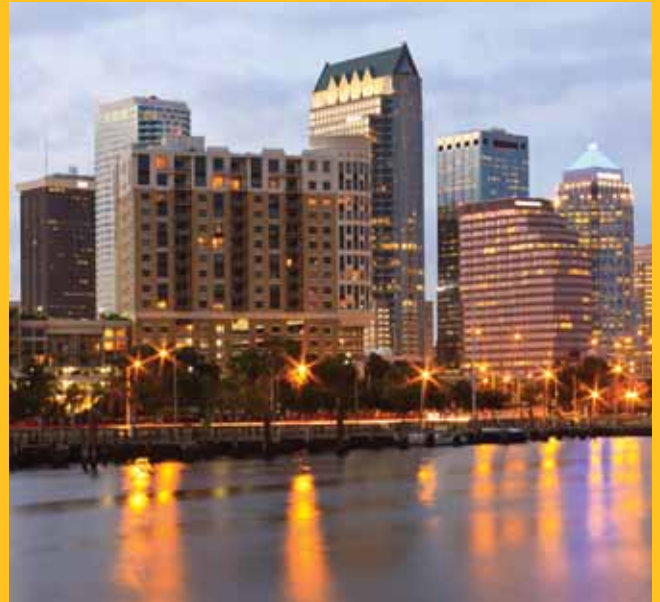
Antiques Roadshow "Vintage Tampa" It's been 15 years since Antiques Roadshow first visited Tampa. Highlights include a fork from the Hindenburg; a costume jewelry hat from around 1950; and a Louis Comfort Tiffany lamp, whose value has more than doubled since we first saw it. Airs Friday, July 11, 8 p.m.