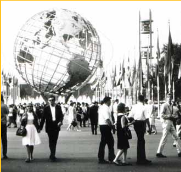
The 1964 World's Fair This fascinating documentary, narrated by Judd Hirsch, takes a look at the sights and sounds of the memorable exhibition that symbolized the epitome of innovation. Features fond remembrances, historical perspectives and news footage from the era. Airs Wednesday, July 16, 10 p.m.