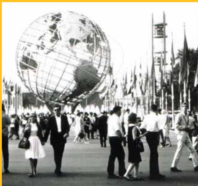
The 1964 World's Fair This fascinating documentary, narrated by Judd Hirsch, takes a look at the sights and sounds of the memorable exhibition that symbolized the epitome of innovation. Features fond remembrances, historical perspectives and news footage from the era. Airs Wednesday, July 16, 10 p.m.