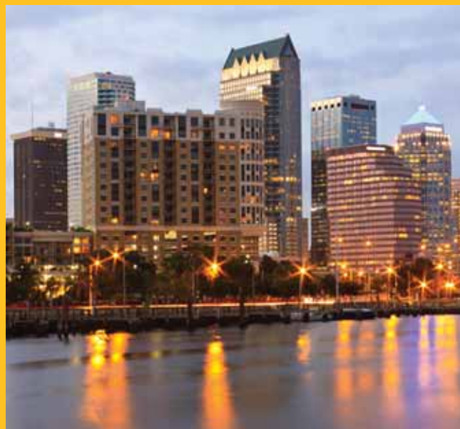
Antiques Roadshow "Vintage Tampa" It's been 15 years since Antiques Roadshow first visited Tampa. Highlights include a fork from the Hindenburg; a costume jewelry hat from around 1950; and a Louis Comfort Tiffany lamp, whose value has more than doubled since we first saw it. Airs Friday, July 11, 8 p.m.