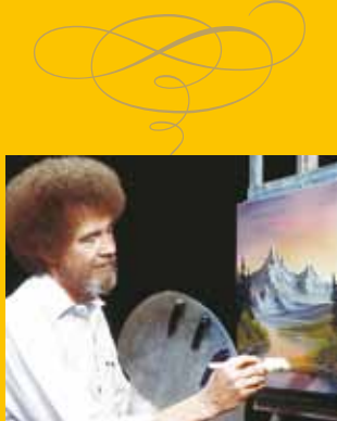
If you missed it last time, Bob Ross: The Happy Painter encores Wednesday, June 4, 10 a.m.