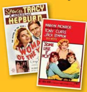
Treat yourself to some great classic films this month, including Some Like It Hot, Woman of the Year, The Picture of Dorian Gray and Cabaret – Saturdays at 9 p.m.!