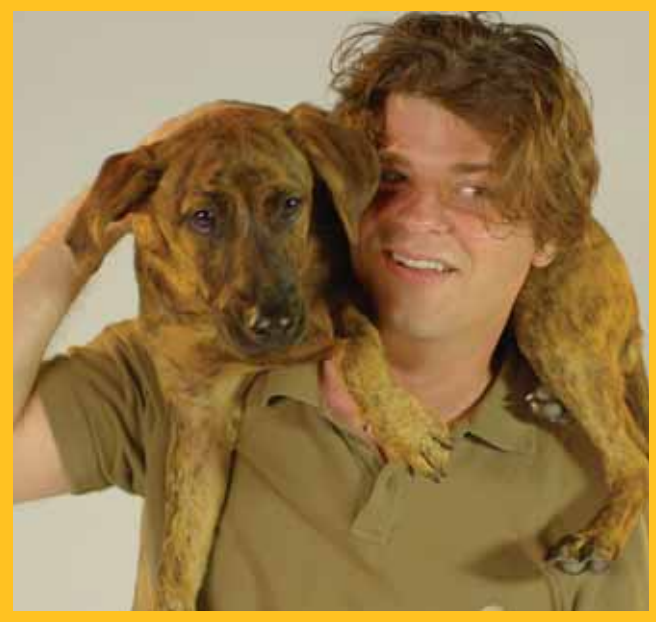
NOVA: Inside Animal Minds What would it be like to go inside the mind of an animal? In this mini-series, NOVA explores breakthroughs in animal cognition through dogs, birds and dolphins uncovering surprising similarities to—and differences from—the human mind. Airs Sundays, May 4,11, and 18, 8 p.m.