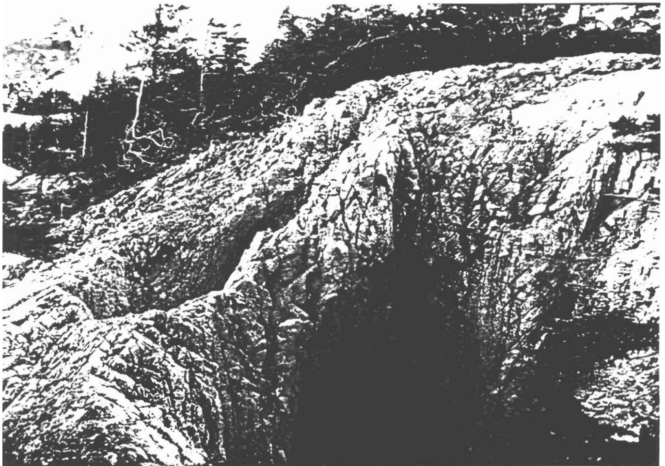
She Devil's Hell Hole, Coronation Island.