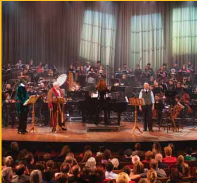
A Christmas Carol: The Concert The first time Dickens' classic tale has been adapted for a live orchestral concert with choir and soloists, and performed for audiences in a concert setting. The stirring score recalls Broadway classics and is filled with memorable, haunting and rousing songs. Airt Tuesday, December 24, 8 p.m.