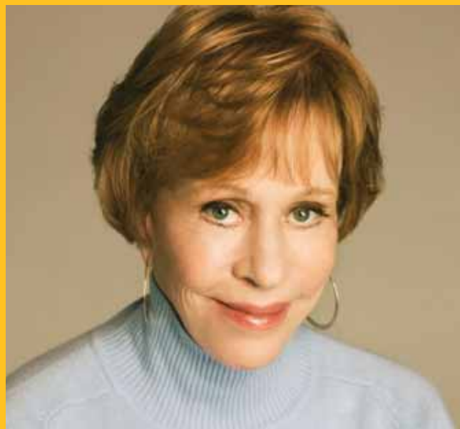
Carol Burnett: The Mark Twain Prize Carol Burnett is the guest of honor when the comedy world convenes to toast this year's recipient of the Kennedy Center's Mark Twain Prize for American Humor. The cast includes Julie Andrews, Lucie Arnaz, Tony Bennett, Tim Conway, and Tina Fey. Airs Tuesday, December 31, 8 p.m.

To customize your experience on pbs.org, choose WUSF Public Media, your First Choice for public television!