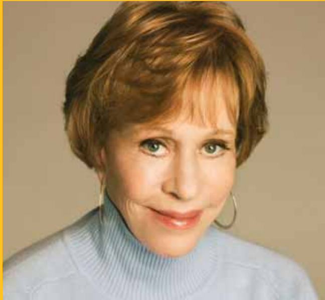
Carol Burnett: The Mark Twain Prize Carol Burnett is the guest of honor when the comedy world convenes to toast this year's recipient of the Kennedy Center's Mark Twain Prize for American Humor. The cast includes Julie Andrews, Lucie Arnaz, Tony Bennett, Tim Conway, and Tina Fey. Airt Tuesday, December 31, 8 p.m.

To customize your experience on pbs.org, choose WUSF Public Media, your First Choice for public television!