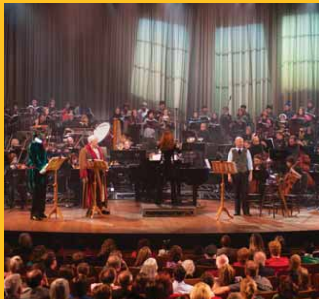
A Christmas Carol: The Concert The first time Dickens' classic tale has been adapted for a live orchestral concert with choir and soloists, and performed for audiences in a concert setting. The stirring score recalls Broadway classics and is filled with memorable, haunting and rousing songs. Airs Tuesday, December 24, 8 p.m.