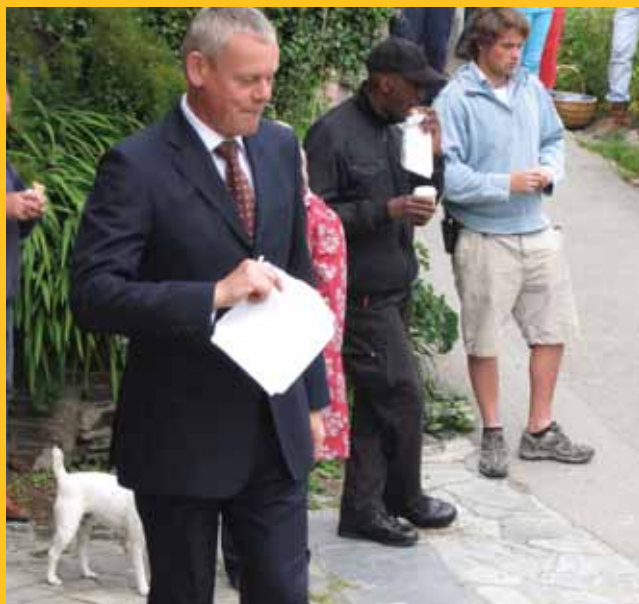
Doc Martin: Revealed features behind-the-scenes footage from season six shot on location in Cornwall. Viewers get inside access to the actors and crew as they film sequences on the balcony at Large's Restaurant and in the nearby pub that doubles for the Crab & Lobster. Airs Tuesday, December 3, 9 p.m.