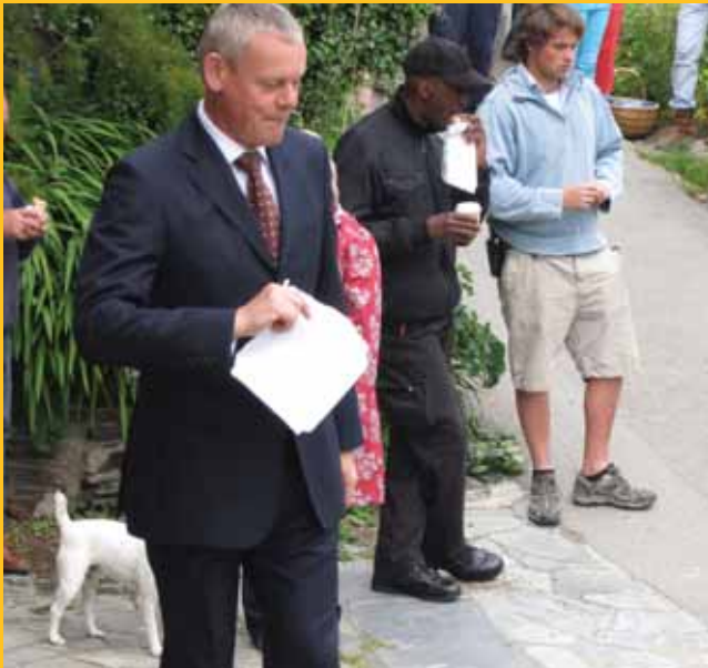
Doc Martin: Revealed features behind-the-scenes footage from season six shot on location in Cornwall. Viewers get inside access to the actors and crew as they film sequences on the balcony at Large's Restaurant and in the nearby pub that doubles for the Crab & Lobster. Airt Tuesday, December 3, 9 p.m.